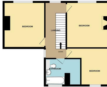
1ST FLOOR 612 sq.ft. (56.9 sq.m.) approx.