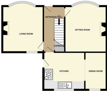
GROUND FLOOR 631 sq.ft. (58.6 sq.m.) approx.